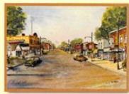
Produced by the Huron Public Library in cooperation with the Northwest Regional Library System